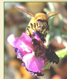
Bees pollinating on a lavender bush.