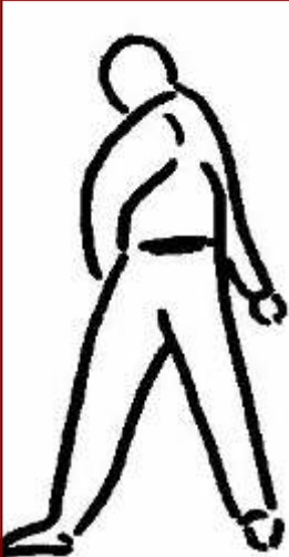
Swing arms from side to side