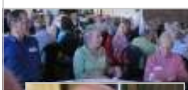
Asquith Vols Lunch

Hornsby (DD): People in my situation know the worry you take away. We can stay in our own homes & have pride.