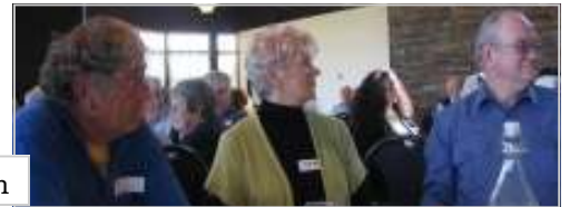
Asquith Vols Lunch