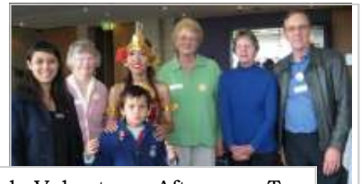
Ryde Volunteers Afternoon Tea